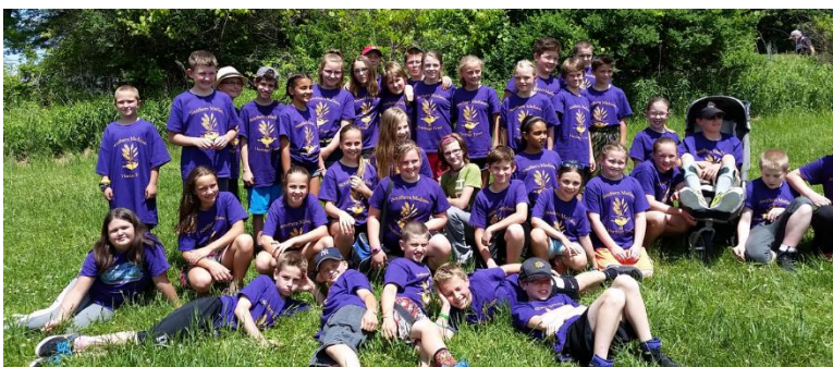
Photo: 5 th graders in SMHT logo t-shirts as reward for participating in the field school.

Leland Reserve: SMHT continues to provide the Hamilton Central School 5 th grade environmental field trip program with visits in the winter (on snowshoes we provide), spring, and fall. We also will arrange for a Madison school field trip next spring. The students plant trees provided by SMHT and over the last eleven years have developed an area we call the 5 th Grade Forest. We plan to install a marker to designate the area. Well over 100 trees have been planted to date, including pine, spruce, maple, black walnut, and redbud.